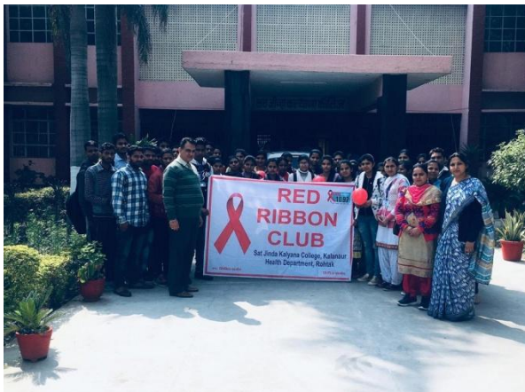
AIDS Awareness Programme on 07.04.2018