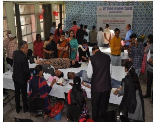
Blood Donation Camp on 01.03.2021