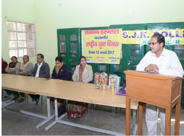
Celebration of National Youth Day on 12.01.2017