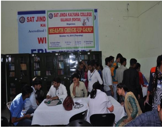
Health Check-up Camp on 10.10.2019