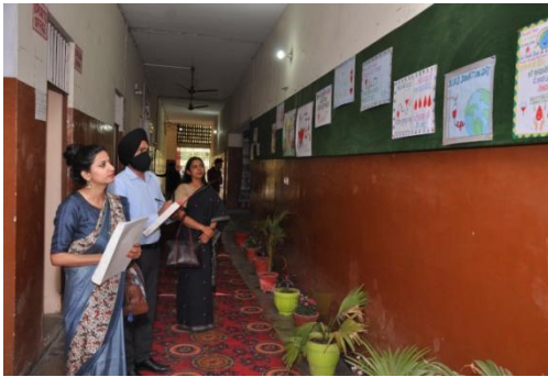
Slogan Writing Contest on 01.03.2021