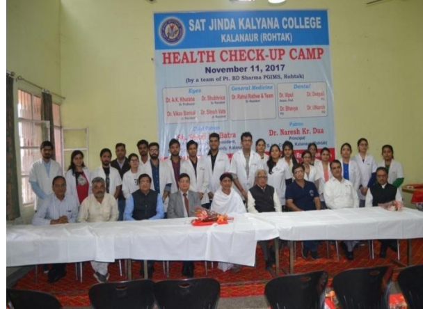
Health Check-up Camp organized on 11.11.2017